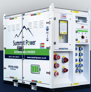
BATTERY ENERGY STORAGE SYSTEM