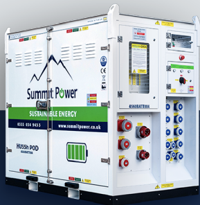
BATTERY ENERGY STORAGE SYSTEM