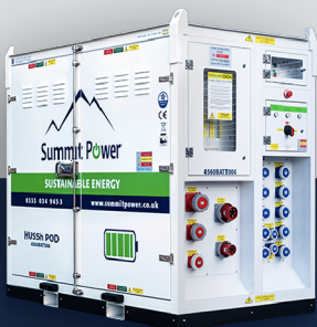
BATTERY ENERGY STORAGE SYSTEM