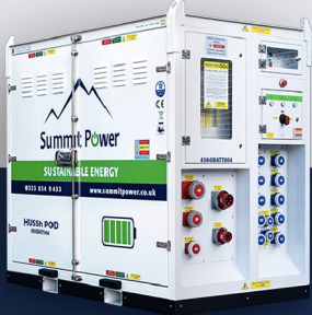
BATTERY ENERGY STORAGE SYSTEMS