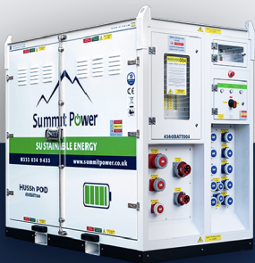
BATTERY ENERGY STORAGE SYSTEMS